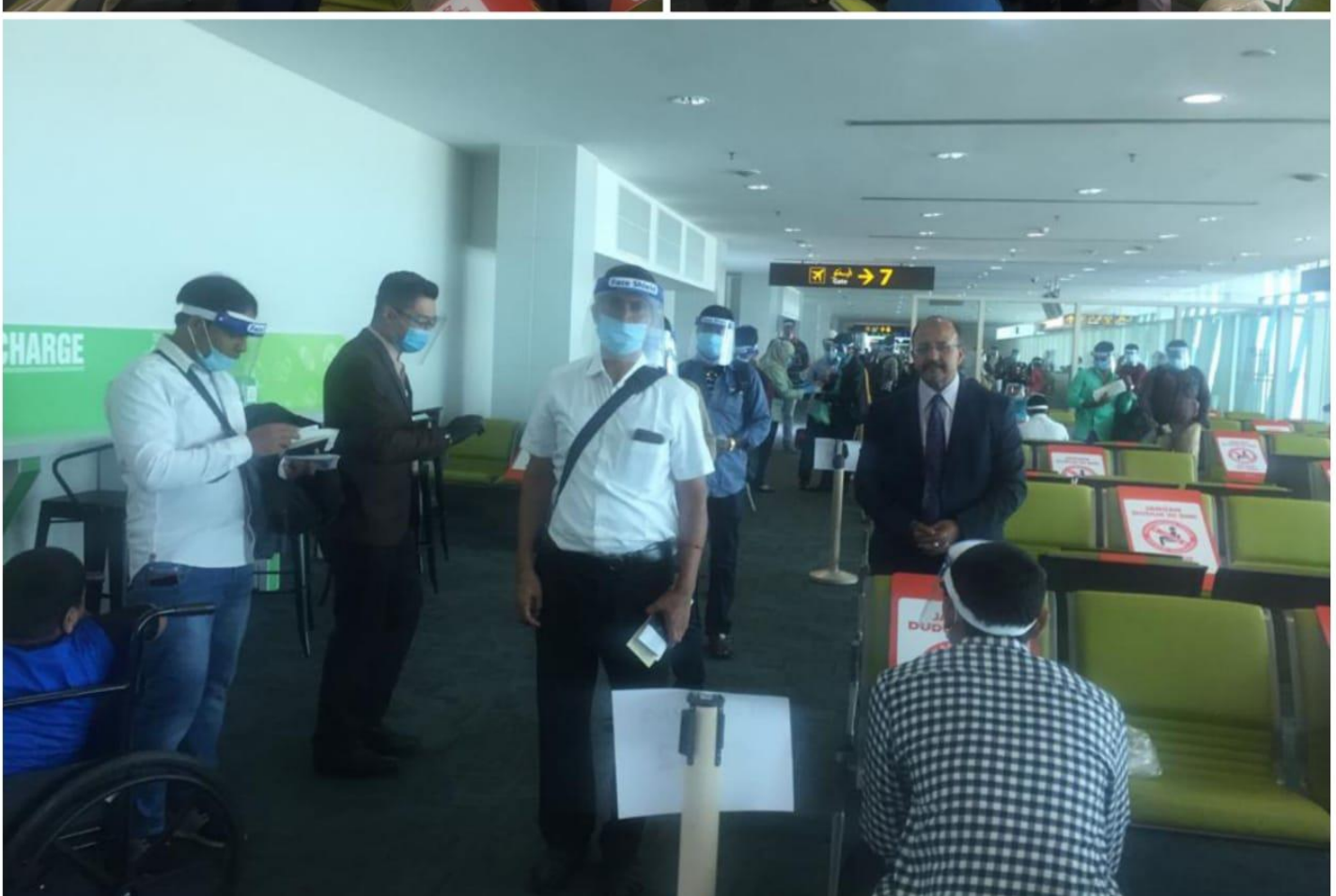
So far, 546 stranded Indian nationals have been repatriated to India in 4 flights which were operated on 3<sup>rd</sup> July, 31<sup>st</sup> July, 18<sup>th</sup> September and 2<sup>nd</sup> October 2020.